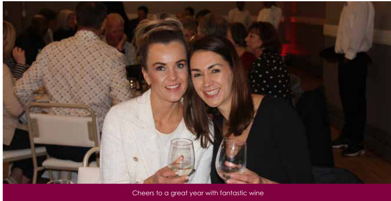
Cheers to a great year with fantastic wine

As 2023 comes to an end, the Wine Fraternity reflects on the past year: a year of exquisite wines and cherished moments shared with fellow wine enthusiasts. Nestled in the heart of Pretoria, our fraternity has continued to thrive, providing a haven for wine enthusiasts to savour the finest vintages, create lasting memories, and deepen their passion for the art of winemaking.