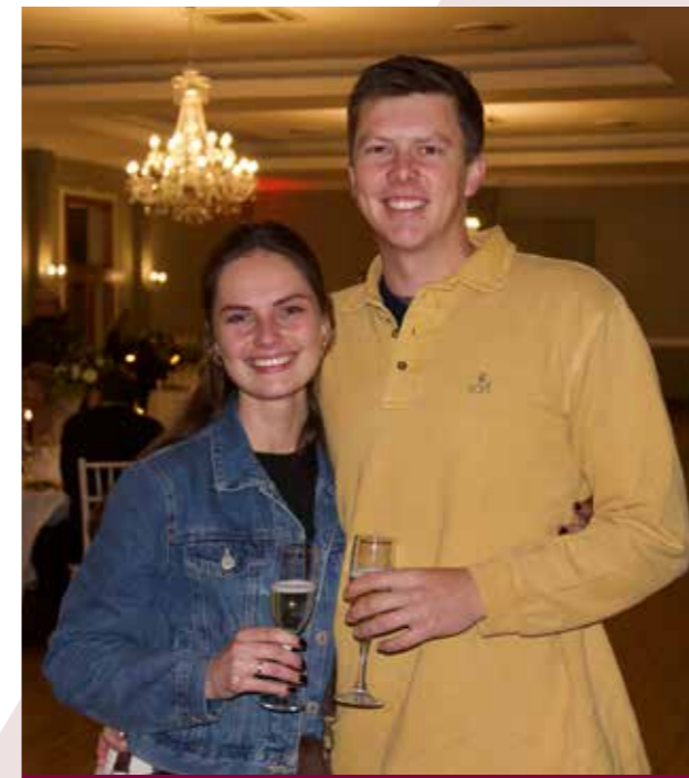
Haute Cabrière wine tasting

A highlight of our wine calendar was the Cape Winemakers Guild event. Pretoria Country Club had the pleasure of (once again) hosting the top guns of South African winemakers. Winemakers of the Cape Winemakers Guild presented and showcased their wines – made exclusively for their annual auction – at a formal tasting. The day concluded with a relaxed braai, which we enjoyed with more incredible wine!