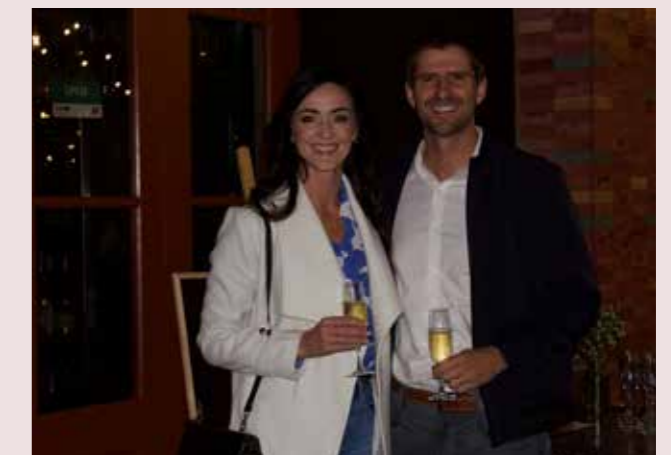
Saronsberg wine tasting