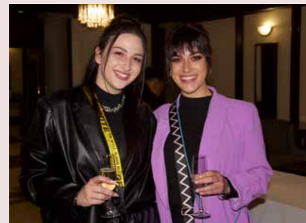
Champers to start the evening