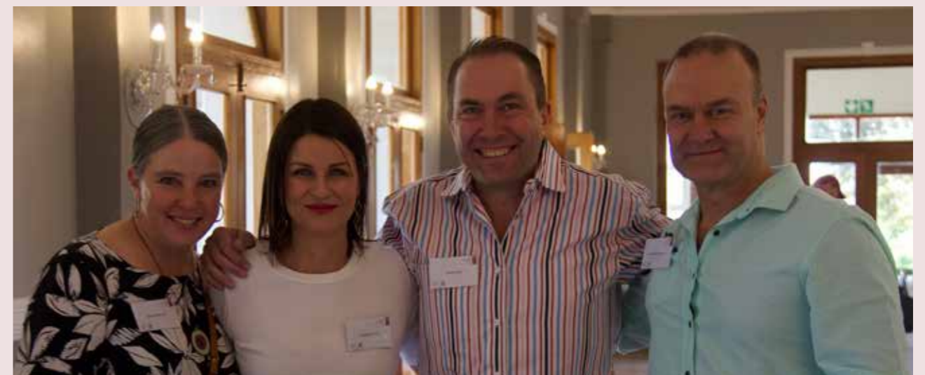
Cape Winemakers Guild event